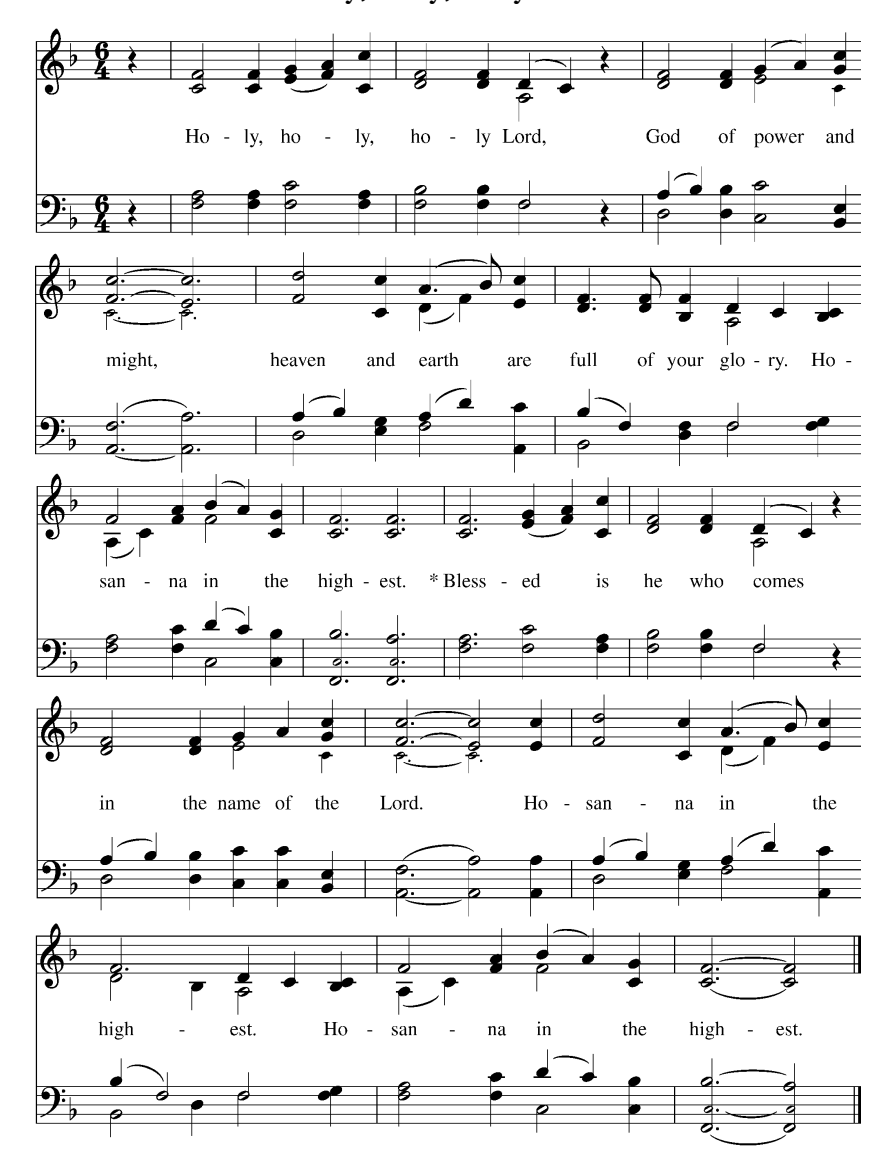
The Celebrant continues. The congregation is invited to stand or kneel as able.

Celebrant: Therefore we proclaim the mystery of faith: